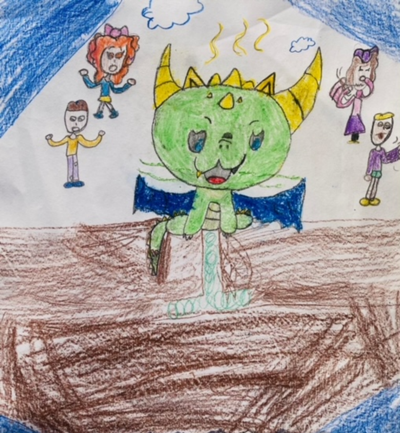
Once there was a little Dragon who did not like to brush his teeth.