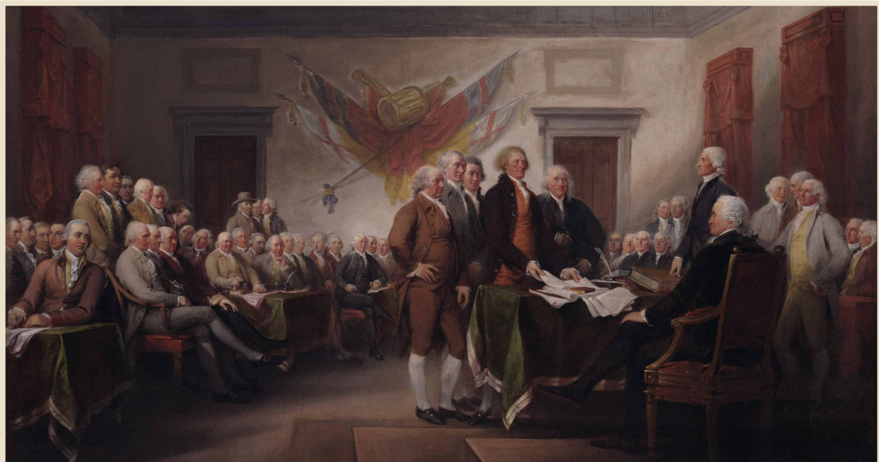
The Declaration of Independence by John Trumbull